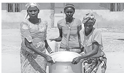
Lunch time! Athooch