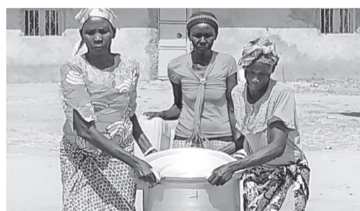
Lunch time! Athooch